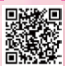
晚宴場刊 Banquet Brochure