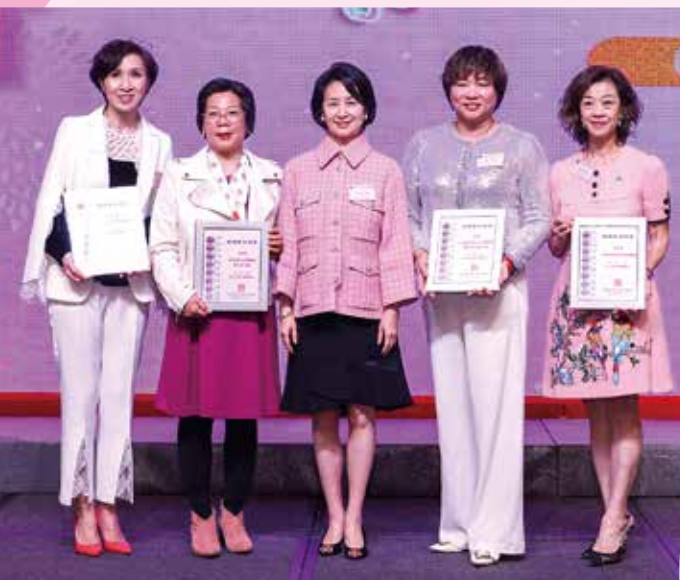
何超瓊主席(中)與新加入之團體會員及附屬團體會員代表合照。 Ms. Pansy Ho (Middle), HKFW Chairperson poses for a photo with representatives of newly joined Corporate Members and Associate Corporate Members.