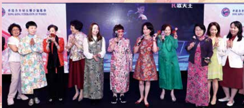
歌唱籌款 Charity Singing at Dinner