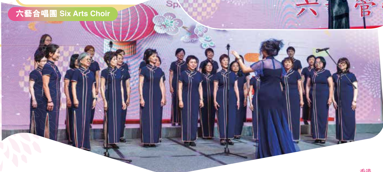
六藝合唱團 Six Arts Choir