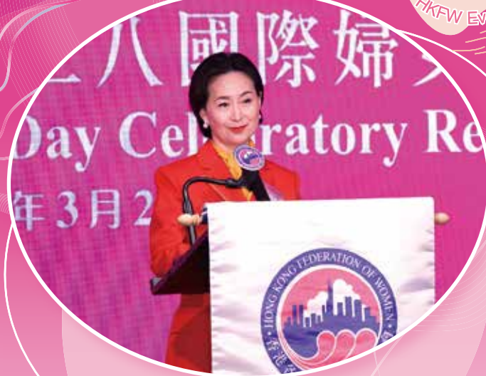
香港婦協何超瓊主席致歡迎辭。 Welcome Speech by Ms. Pansy Ho, HKFW Chairperson