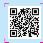
UN CSW NY 回顧視頻 (由學生代表拍攝)

行政長官李家超(後排左6)及夫人、香港婦協名譽贊助人李林麗嬋(後排左5)、香港婦協主席何超瓊(後排左4)、香港婦協永遠名譽主席林貝聿嘉博士(後排右6)與各位合影。