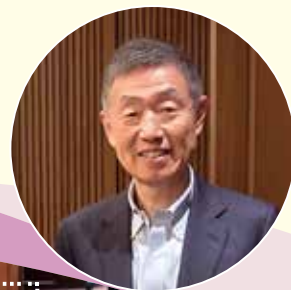
主講嘉賓單偉健教授 Professor Shan Weijian