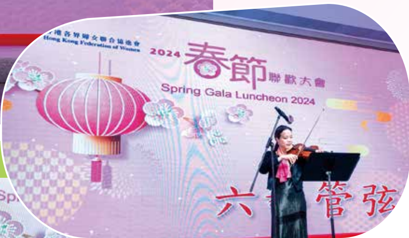
六藝管弦樂團樂手 Musican from Six Arts Orchestra