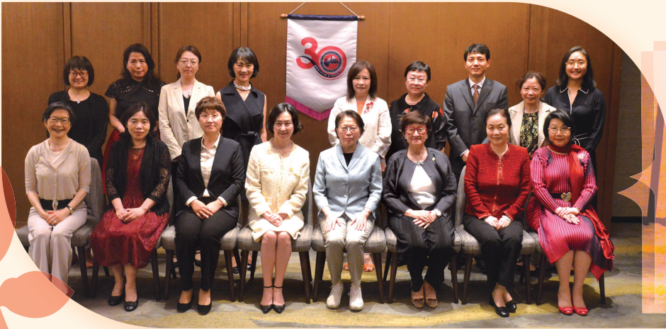
全國婦聯黨組書記、副主席黃曉薇(前排右4)一行於2023年7月1日與婦協主席團成員聚餐。 On July 1, 2023, Ms. Huang Xiaowei (Front Row, Right 4), Secretary of the Leading Party Members' Group, Vice President of the All-China Women's Federation, had a dinner with members of HKFW Presidium.