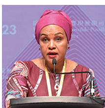
桑給巴爾總統夫人 瑪利亞·姆維尼女士 Madam Mariam Mwinyi, First Lady of Zanzibar

Organized by HKFW and co-organized by the Golden Bauhinia Women Entrepreneurs Association, the third Women Power Forum was supported by the Coordination Department of the Liaison Office of the Central People's Government in the Hong Kong Special Administrative Region, the International Organizations Department of the Office of the Commissioner of the Ministry of Foreign Affairs of the People's Republic of China in the Hong Kong Special Administrative Region, the Hong Kong Trade Development Council, the Equal Opportunities Commission, and the Women's Commission with the Hong Kong Palace Museum as a collaborator. Influential women of various organizations from all over the world joined hands together to promote and empower women as a means of repaying the society.