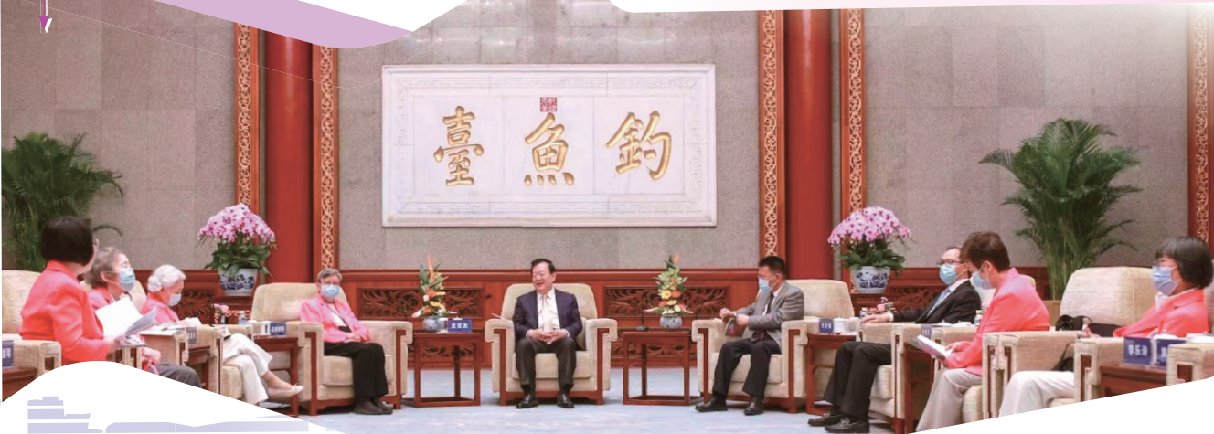
全國政協副主席咸輝女士(前排中)會見訪京團，暢敘友情。 Beijing Delegation's warm exchange and friendly reunion with Ms. Xian Hui (4th from right), Vice Chairperson of the Chinese People's Political Consultative Conference