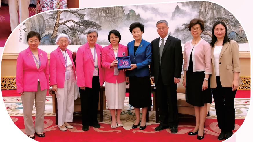
全國婦聯主席沈躍躍(中)和代表團親切交流。 Ms. Shen Yueyue, Chairperson of the All-China Women's Federation, took a photo with the delegation from HKFW visiting Beijing.